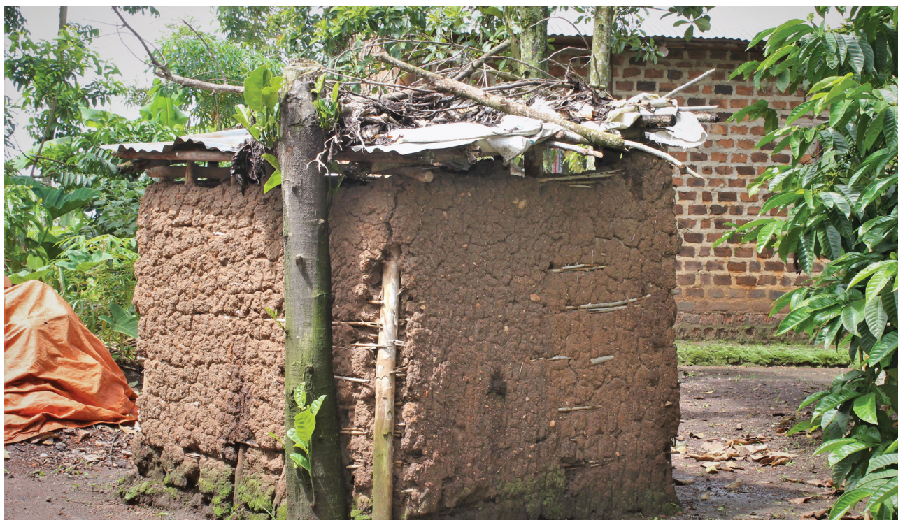
Paul Kayonga's pit latrine in Sseganga Wakiso District, Days before Sapphire Africa Foundation Constructed a fully functional modern pit latrine.

serious health and safety risks, prompting intervention from local authorities. The old pit latrine had deteriorated over time, compromising the safety and well-being of the family members. Recognizing the critical nature of the situation, local authorities deemed it necessary to address the issue promptly. The new facility aimed to provide a sustainable and long-term solution to the family and also be a model facility for Hygiene.