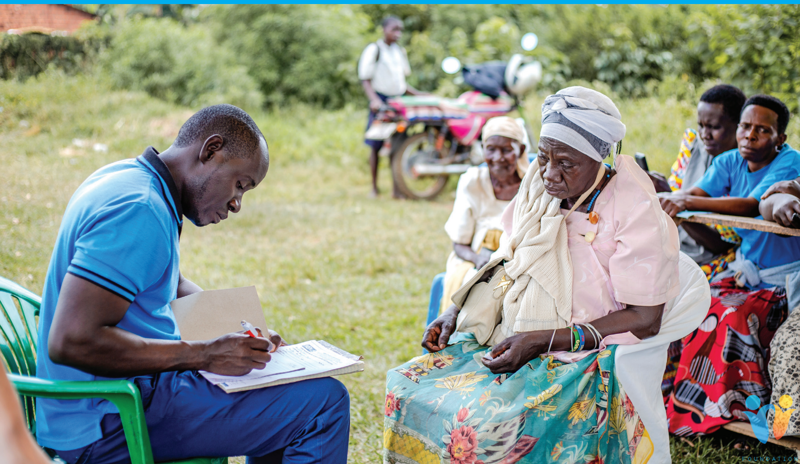
A member of MBN lab attends to a patient at the Sapphire Medical Camp 2023. Sapphire Africa Foundation Partnered with MBN laboratories to treat more than 3500 people in Nakaseke District

Through engagement with businesses, Sapphire Africa Foundation reached over 2000 children and the recent example has been our recently finished Medical Camp. 23 country Coordinators and National Committees reported successful engagements with over 46 businesses and we hope this will create a significant change. Close collaboration with local partners remained a priority in 2023, as Sapphire Africa Foundation worked with 7 civil society partners including Bountiful generation humanitarian response.